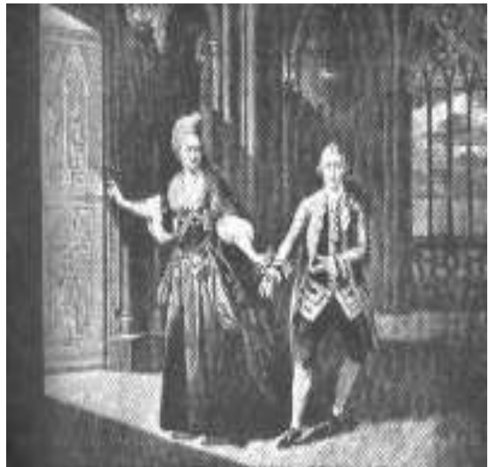
David Garrick is seen here with Mrs. Prichard in MACBETH - notice Mr. Garrick's small stature.