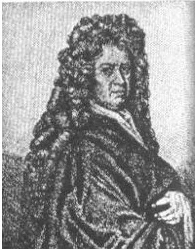
THOMAS BETTERTON [1635-1710]

Lowin is reputed to have been the first Hamlet.