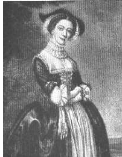
Peg Woffington [1718-1760]

Betterton has been called the first great English actor.