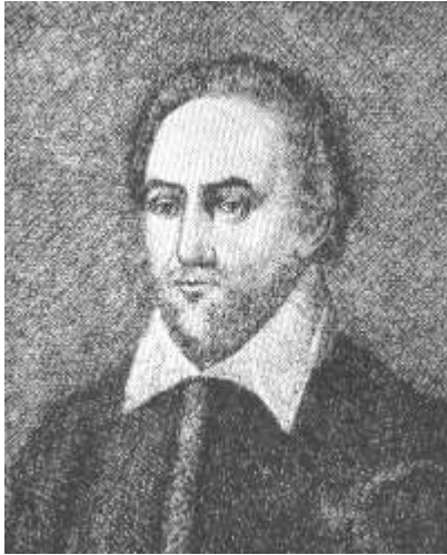
RICHARD BURBAGE [1567?-1619]

Burbage was the leading actor of the company for which Shakespeare wrote.