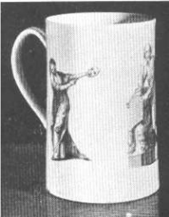
The mug from which he pledged the memory of Shakespeare at the 1769 Stratford Jubilee.