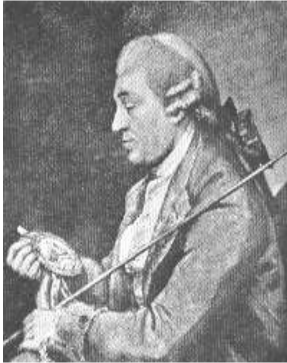
David Garrick as Master of Ceremonies at the celebrated Stratford Jubilee in honor of Shakespeare in 1769.

Most likely the most well-known actor in history. Seen here studying the text of MACBETH .