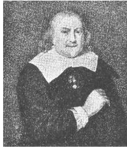
JOHN LOWIN [1576-1658?]

Burbage was the leading actor of the company for which Shakespeare wrote.