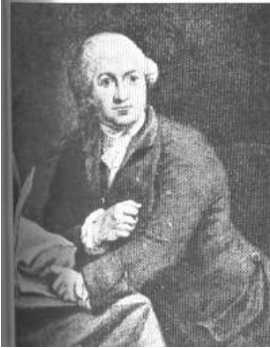
DAVID GARRICK [1717-1779]

Most likely the most well-known actor in history. Seen here studying the text of MACBETH .